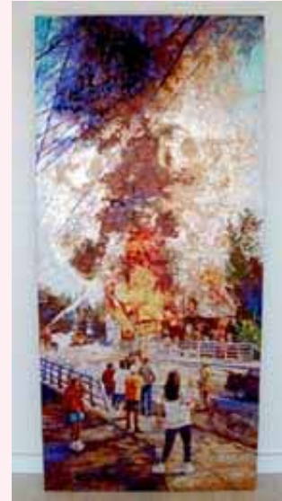
Jamie Vasta, Witness , glitter on panel, 2003

Crafted out of insulation foam, Hillary Baldwin's rocks and skulls delight in their reproduction. The casual littering of her carvings call to mind an excavation site where the major finds is still